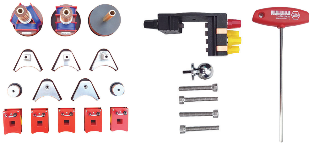
[ Assemble Part ]