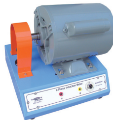
[ 1 Phase Induction Motor ] (1/2HP)