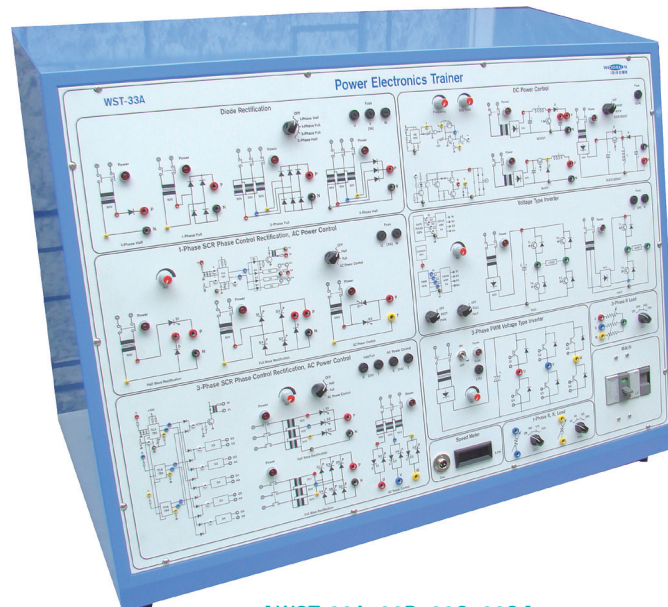
[ WST-33A, 33B, 33C, 33S ]