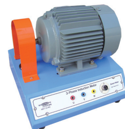
[ 3 Phase Induction Motor ] (1/2HP)